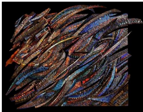
Fig 6, color painting , Giulio Menossi called Nocturne , made of hand-cut pieces of glaze.2010

Based on the analysis of the data described above, we can confirm that the artist Giulio Minosi, as a contemporary artist, whose three-dimensional mural works express visions and creative thought to express the study of the artwork, research, scrutiny, and analysis of standards of beauty in its form and content. On the other side, how can an artist form a strong and profound bond with his creation? We must not forget the materials with which the artists must deal are so rich, beautiful, complex, and powerful that it is a joy and a pleasure just to touch and gaze at them since they are enormously rich in themselves, and each cut is a micro-piece of abstract art. (Fig6) (Rereburn, 2011)