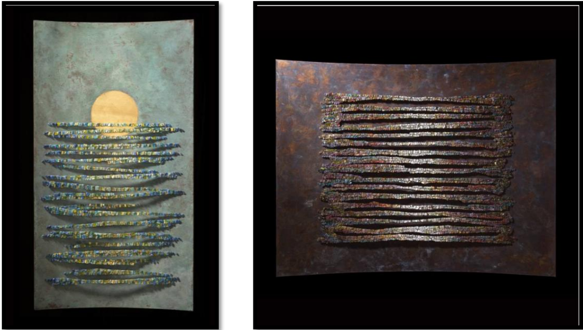
Fig 9, twilight reflection, Glass on other 50 x 90 x 5 D cm, Italy, 2019- Dawn of the Awakening, marble on bronze, 130 x 100 cm

https://www.saatchiart.com/art/Installation-L-Alba-Del-Risveglio/183012/7827178/view