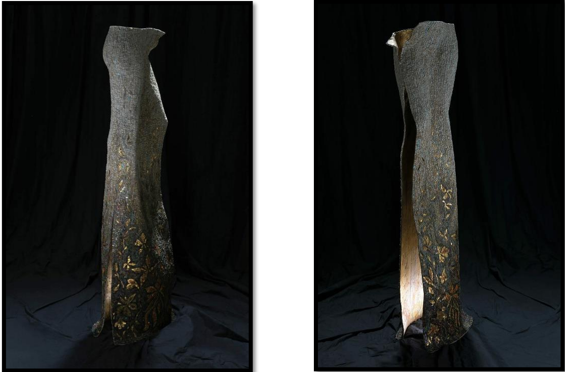
Fig 8, Dino Maccini, L'assenza . 172x50x38, sculpture mosaic on carbon fire, Italy.2018 https://www.saatchiart.com/account/profile/183012

Through the researcher's vision, the artist created in this piece of art, through the innovative nature of the design, a key to many aesthetic uses of the material through abstraction, through various media that influenced the plastic construction of contemporary mural works, as the mural material has aesthetic, philosophical, and intellectual concepts through technological development. Who helped create artistic and plastic formulations characterized by innovation and creativity( Fig 9 )They have been drawn with more explicit and expressive lines especially because of their connection with the relations to the gaps in the artistic work. It follows from this that the materialized mosaic work has gained absolute autonomy with emphasis on ingenuity, creativity, simplicity, output, and good technique in its implementation. This has helped to achieve the goal, vision, and passion and the freedom to adapt them. Contemporary 3D models of mosaic work can be shown by shedding light on objects that are blended and executed in fine cubes.