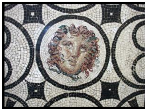
Shape (a), Emblema with gorgoneion. From Pompeii, the House of the Vestals (VI, 1, 7). Early 1st c. CE. Museo Archeologico Nazionale di Napoli.

https://italiana.esteri.it/italiana/en/eventi/a-lione-in-mostra-i-mosaici-dinamici-di-giulio-menossi/