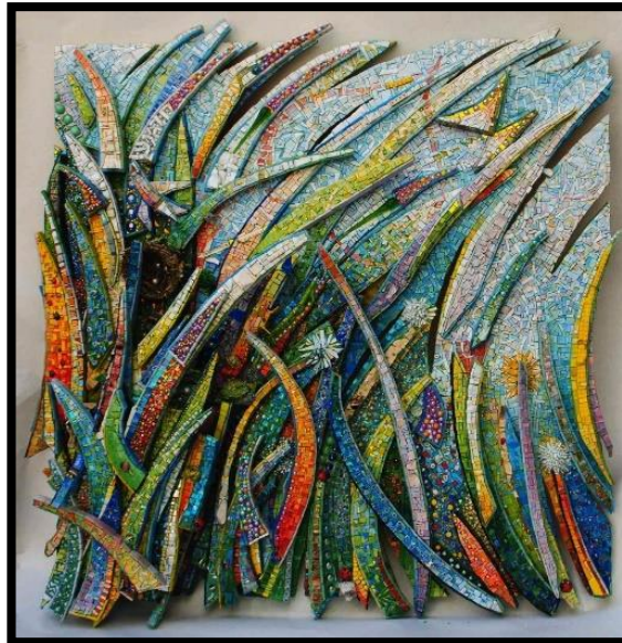
Fig 7, "Primavera" (spring) , Giulio Menossi 2012 100 x 100 cm Smalti, glass bead, millefiori, small branches, and Lego piece.

These aspects represent the molds included in the 3D mural works. If the skill merges with the nature of expression to produce an unpretentious wall artwork, then that takes place through artistic relationships that carry different, diverse, and innovative meanings.