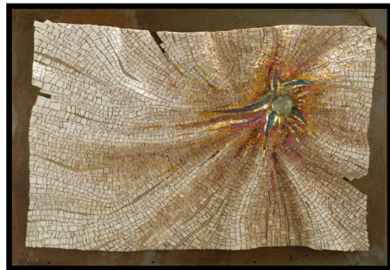
Fig 11, Warm Wind , cm. 145×195smalt, ceramics and wood- Revisitations , stone, Civic https://www.exibart.com/evento-arte/dino-maccini-rivisitazioni/ https://mozaikowanie.pl/index.php/2019/02/09/dino-maccini-historia-nietypowa/

The unique artwork represented Fig11 illustrated the semantic meaning of aesthetic sense in the fluidity of design, color, and homogeneity. The artist was able to formulate the visual representation of the 3D mural artwork in terms of stylistic features, color interaction, and the purity of the effects of harmony by transcending the traditional shapes and symbols of the reilf formation murals with a new formulation that was technical, artistic and used treatments that kept pace with the contemporary and the variables of the era.