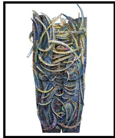
Fig 5, Giulio Menossi " La route de papillons " 2011.