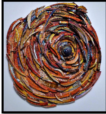
Fig 1, an explosion of shapes and colors combines sculpture and painting, Journey to the Eye of the Sun - Giulio Menossi-2022 https://italiana.esteri.it/italiana/en/eventi/a-lione-in-mostra-i-mosaici-dinamici-di-giulio-menossi/

contemporary murals, surprisingly in terms of conducting experiments but with the total preservation of classical teachings (menossi, 2018) ( Fig 1 )