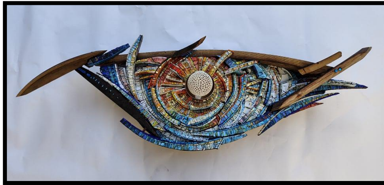
Fig 3, Argentine Eye , Oak barrel staves, smalti, glass paste, plastic, metal, and led 110 x 45 cm 2022, Giulio Menossi

Giulio Minosi's artistic works show us that, in terms of their unique contemporary technology, they are an advanced means of artistic expression through distinctive three-dimensional mosaic works that contain different colors and different tools used, so that all of his works are distinguished by a preferred color tone determined by the method of obtaining the same color, in addition to its symbolism. And its implications as shown in (Fig 3), his works raised a hypothetical controversy through the creation of new techniques and the ability to develop and implement moving models that are not fixed on a wall in terms of wall works related to architecture. In his work, the artist followed the style called Emblemata . “The word "Emblemata" is simply the plural of the Greek word "Emblema", meaning a piece of inlay or mosaic, or an ornament”. (Shape a )