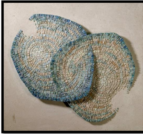
Fig 10, Dino Maccini Inseparable , cm. 49,5x 53,5 https://dinomaccini.it/mosaici-contemporanei-sculture/