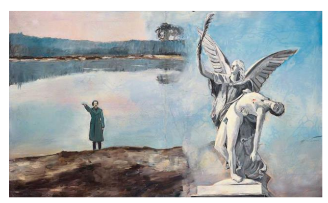
Figure 10: Anselm Kiefer, Heroic Symbol II (Heroisches Sinnbild II) 1970 Würth Collection, Künzelsau © Anselm Kiefer

the Heroic Symbols book (figure 11), namely a Nazi magazine photograph of August Wredow's neoclassical sculpture Nike Carrying a Fallen Warrior up to Olympus 1857, a sculpture much admired by the National Socialists that can be found adorning the Schloßbrücke in Berlin-Mitte and one of Kiefer's original photographs of himself giving the Sieg Heil by a lake, which in the painting is positioned in such a way that he appears to be saluting Nike." (Weikop) Looking at this series, we see how Classicism took up another layer in the collective imagination through its heavy utilization by the Nazi regime, subsequently, using it ironically, sinisterly, or violently, is in a way not only a reading into Classic imagery, but Classic imagery and how it has been used so far.