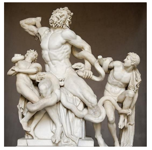
Figure 3: Hagesandros, Athenedoros, and Polydoros, Lacoon and his sons, 1 BCE, copy after a Hellenistic original from ca. 200 BC.