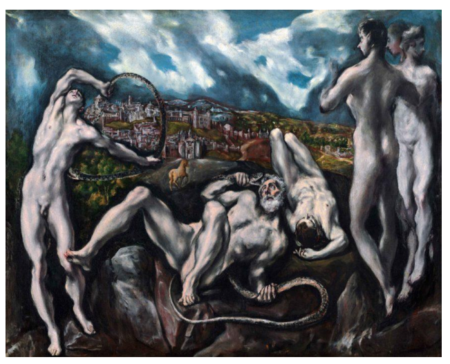
Figure 4: Doménikos Theotokópoulos (El Greco), Laocoön, c. 1610/14, oil on canvas, 137.5 x 172.5 cm, The National Gallery of Art.