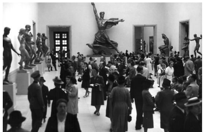
Figure 8: View of sculpture exhibited at the Haus of German Art, n.d., part of the Great Aryan Art Exhibit, 1937.