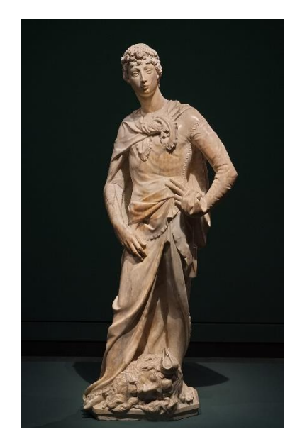
Figure (1) (left): Donatello, Marble David, 1416, Florence, Italy.

We see how works in the Hellenistic period (starting 323 BCE) that choose to highlight different things in the artwork; producing works that contain a sense of emotional intensity, while maintaining the natural/ideal form, most notably, Laocoon and His Sons, first century BCE (Figure 3). These subtle differences, which make the "repetition-cycle" of Western Art history almost inevitable, are also seen in the late Renaissance in both Mannerism and Baroque.