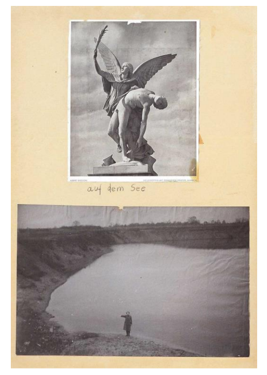
Figure 11: Anselm Kiefer, Heroic Symbol (Heroisches Sinnbild ) 1969 © Anselm Kiefer Source: tate.org.uk