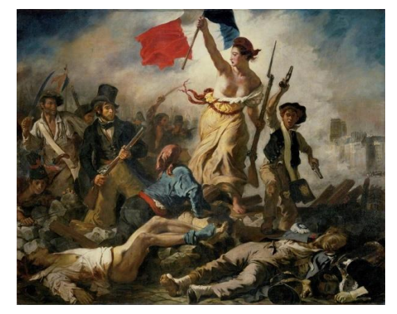
Figure 6: Eugène Delacroix, Liberty Leading the People (July 28, 1830), September – December 1830, oil on canvas, Musée du Louvre, Paris