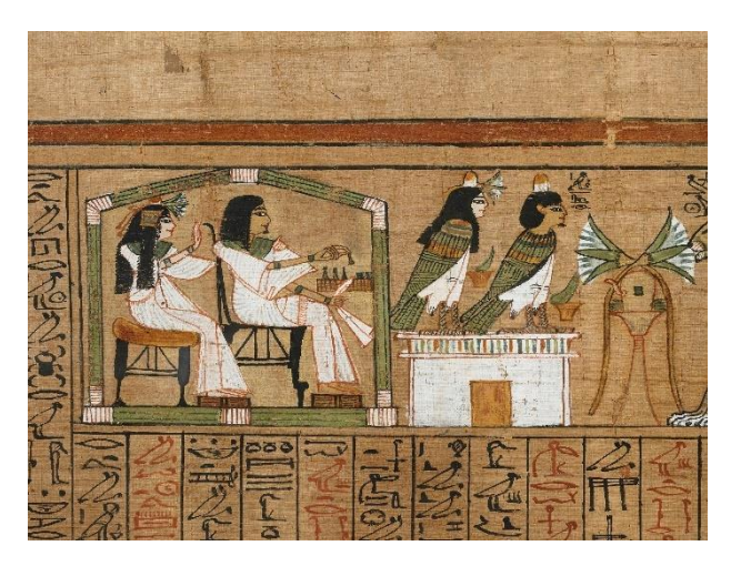
Figure 1: Ba birds © The Trustees of the British Museum. (British Museum: Unknown,