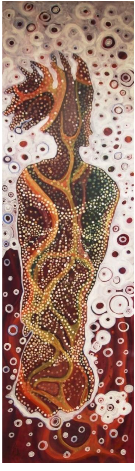
Figure 8: Heavens (3), (200x60 cm). (Author: Author, 2020).