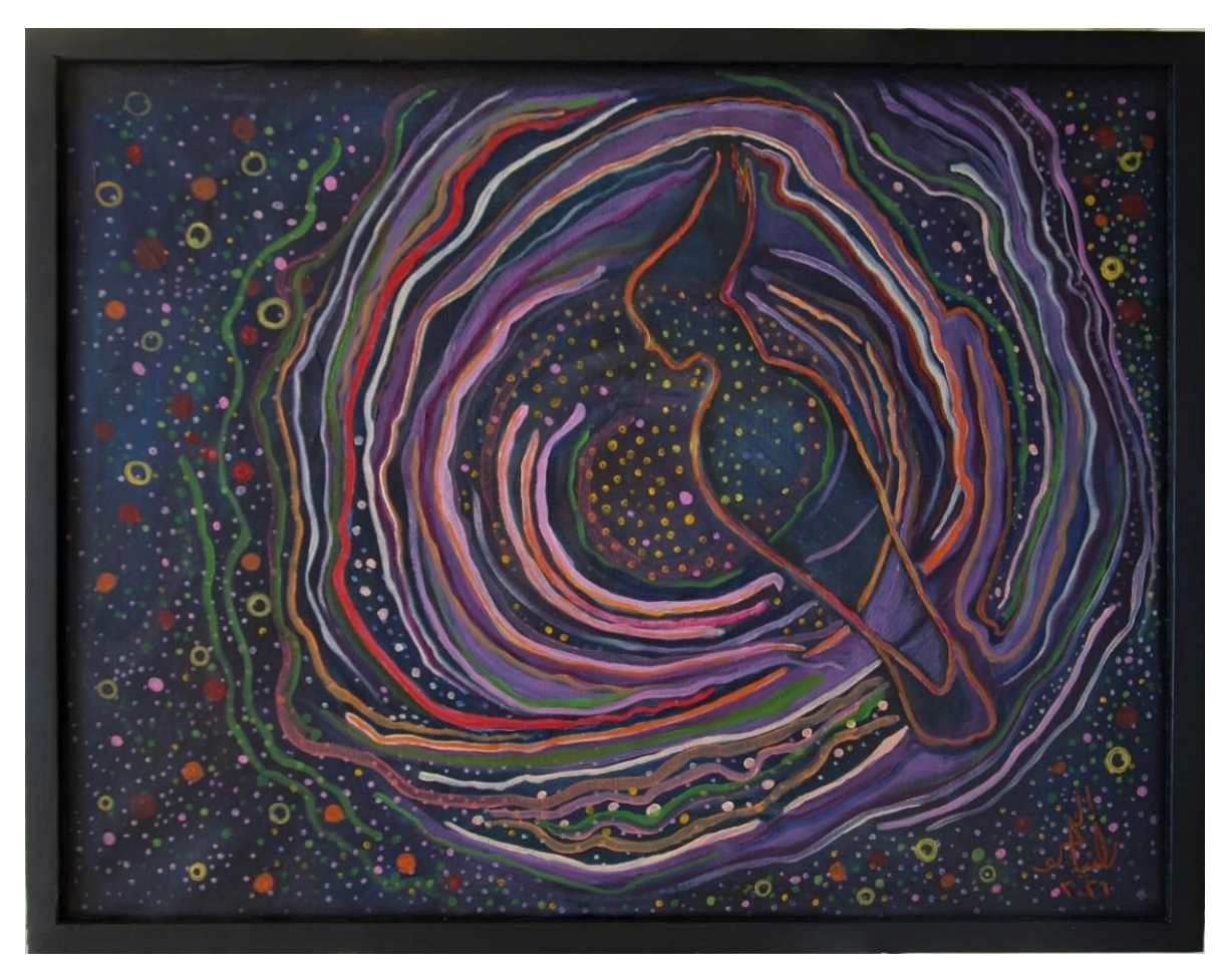
Figure 15: At Night (3), (85x58 cm). (Author: Author, 2021).

Afterwards, comes another group of separate paintings called "At Night". All three are drawn mostly in a linear manner rather than creating form with light and shadow nor through coloring the drawn birds; while getting the inspiration from the different photography images of the outer space showing stars and galaxies from far, as well as the exceptional colors of the aurora phenomenon that appears in skies of the northern countries. The first is "At Night (1)" (fig. 13), where a female bird is drawn as an outline that seems floating over a group of interlacing lines in warm and cold colors forming something like a flower, in a dark sky lit with light spots like the stars. Then in "At Night (2)" (fig. 14) the universe that appeared in the first image in the background is all enclosed in the body of a male bird, looking downwards at the successive irregular lines in several green grades moving like clouds of space dust. The third painting in the group "At Night (3)" (fig. 15) is a depiction of a colored female bird floating on a branch enclosing the whole universe. The bright colored intermingling lines surrounding it are more like vibrations in the realm around the figure.