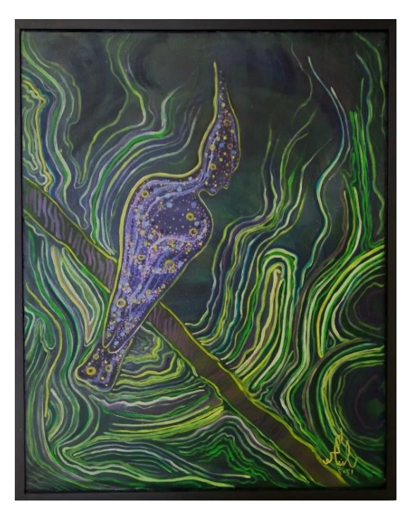
Figure 13: At Night (1), (45x58 cm). (Author: Author, 2021).