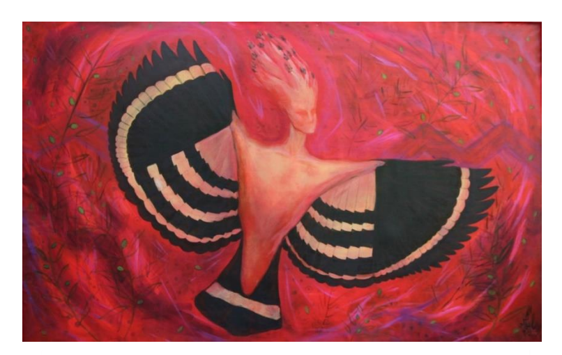
Figure 16: Olives (84x135 cm). (Author: Author, 2021).

The last group of paintings of this research is composed of two separate paintings. The first one is "Olives" (fig. 16), and the second one is "Figs and Pomegranate" (fig. 17). Both red paintings are executed on a mixture of bright grades and shades of magenta, crimson and primary red in the backgrounds. The choice of figs, pomegranates, and olives were set because they are mentioned in some verses of the holy book of Quran denting that they are to be found by the kind ones who will get resurrected in paradise. However, the researcher chose the figs and the pomegranate to be suspended in the space around the female figure for their aphrodisiac connotations for love and prosperity, while the olives were chosen for the male figure in the other painting without having any special connotations with gender other than it just symbolizes peace and the power of healing. Moreover, we can find the main difference in how the wings are in clear regular lines when they are fanned out as mentioned before to represent the male figure, while the lines get soft and a bit irregular when the wings get to pulled close to the body to represent the other female figure.