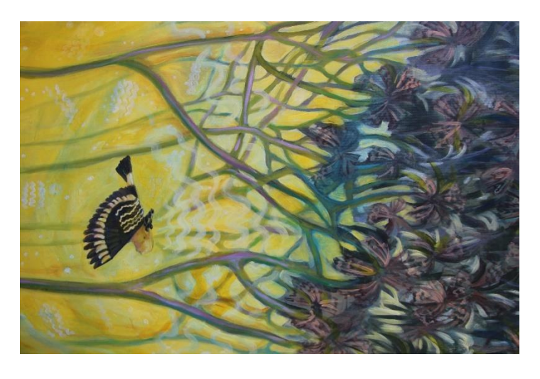
Figure 12: Details from Djehuty Treas Tryptich, 2021. (Author: Author, 2020).