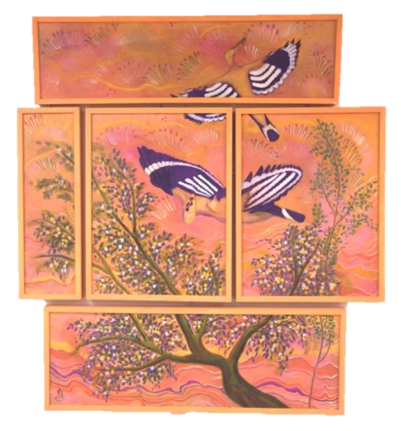
Figure 3: Orange Blossoms. (Author: Author, 2020).

The first painting of the exhibition is "Orange Blossoms", (fig. 3). It is a group of five pieces of canvas painted in acrylic and oil painting and are installed in a certain sequence, where a couple of hoopoes are wandering over a huge and fruitful orange tree, with a background full of rhythmic lines in warm colors. The researcher got inspired by the Indian miniatures' illustration scenes from the Persian poetry book the "Conference of the Birds", such as the one by an unknown artist ca. 1610 (Jahangir Period) (fig. 4), that is a hoopoe drawn with opaque watercolor and gold on paper with dimension (27.6 x 18.7 cm). The piece is a gift of Jane Werner Watson to the Chazen Museum of Art under Accession No.1973.17. Similarly, the researcher decided to mix two- and three-dimensional styles of drawing together in the same scene to form an imaginary place that resembles a paradise full of flowers, fruits, and