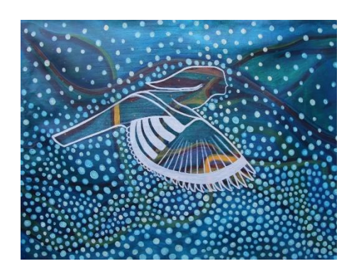
Figure 6: Heavens (1), (60x79 cm). (Author: Author, 2020).