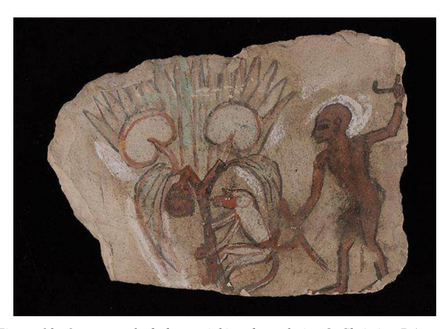
Figure 10: Ostracon of a baboon picking doum fruits, © Christian Décamps. (LEJEUNE: EgyptoMusée à Marcel Proust, 2014).

Doum-palm trees have been related with the Egyptian deity Thoth that embodied wisdom, intelligence, and knowledge, who was usually depicted either by a scouting baboon or an ibis bird. The Ancient Egyptian associated Doum-palm trees with baboons who were found living on their highest points and fed on Doum fruits. (Abd El-Ghany et al., 2016. P. 8). An example of an ostracon depicting such a scene with Thoth as a baboon (fig. 10) was found in Deir El-Medina and is currently showcased in room 5 in the Department of Egyptian Antiquities in the Louvre Museum in Paris, under Louvre E 27666. (LEJEUNE, 2014).