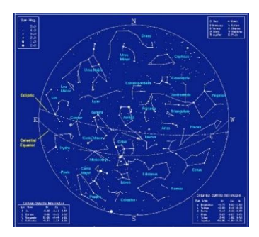
Figure 5: Celestial Constellations by aeroman3. (Unknown: Creativecommons.org,2021)

"Heavens 3" (fig. 8) is a depiction of the hoopoe bird from backwards. This time the figure itself is executed in different light tints of warm colored spots over a background of irregular warm colored lines and spaces of dark red shades. The overall execution is inspired with the traditional aboriginal painting technique of drawing in Australia, such as in "Witchetty Grub Dreaming" by the artist Jennifer Napaljarri Lewis. (Wepf, 2018). Similarly, the researcher used different spaces of coloring in relation with different values of colors and sizes for the spots, like in (fig. 9). Moreover, the vertical body is drawn in a position that resembles the Osirian form of the deceased.