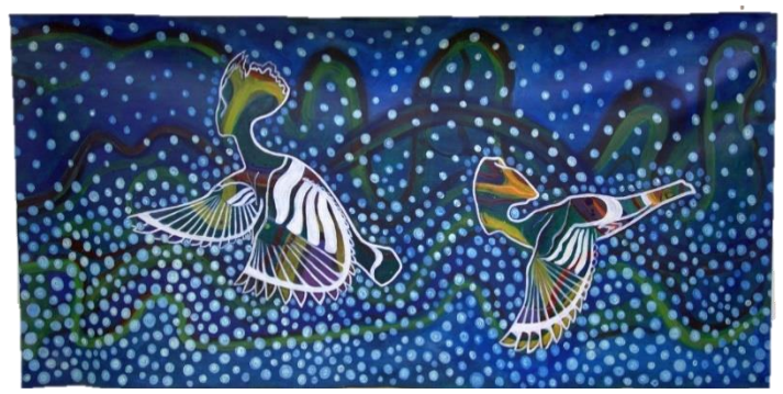
Figure 7, Heavens (2), (60x120 cm). (Author: Author, 2020).