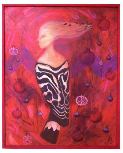
Figure 17: Figs and Pomegranate, (78x64 cm). (Author: Author, 2021).