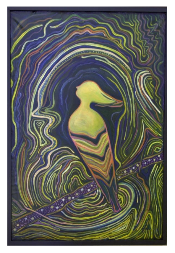
Figure 14: At Night (2), (74x58 cm). (Author: Author, 2021).