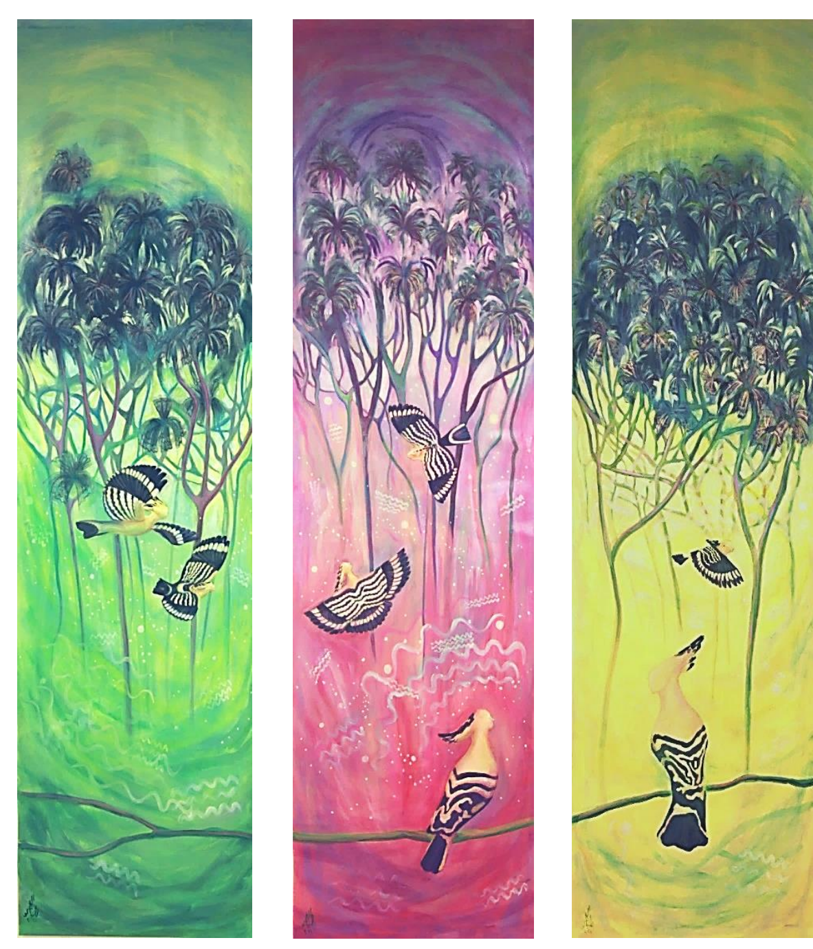
Figure 11: Djehuti Trees Triptych each (200x60 cm). (Author: Author, 2020).