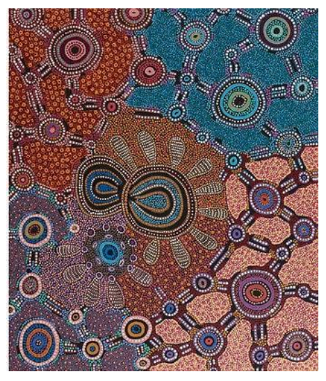
Figure 9: Witchetty Grub Dreaming. (Wepf: The Conversation, 2018).