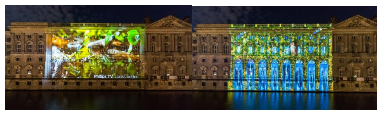
Figure 20, The Neuer Marstall 2010 -animal shots alternated with landscape shots