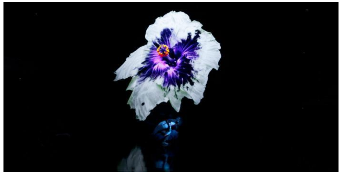
Figure 4, showing the purple flower animated to bloom open, flutter and burst into purple color. Director: Julie Taymor - Scenic Designer: Es Devlin

The show was directed by Julie Timer who created an interactive light show. Projection is tightly interwoven with lighting and set elements. The design features starkly contrast imagery that borrows its appearance from traditional silhouettes, cut outs as well as real flowers, ferns, roots and branches. The projection surfaces consist of a variety of moving fabrics, the back wall and thin air. All projected elements move, sway, rise or fall, blur or sharpen, appear and disappear to give the design a dream-like quality. (Figure 4 & 5).