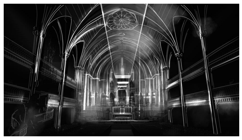
Figure 13, shows a drawing of the walls of the Notre Dame Church from the inside using the X-Agora program, lines analysis, and 3D drawing of laserdefined areas of light