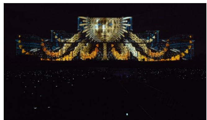
Figure 14, showing the architectural façade of the monumental Roman Parliament Palace

An international competition is held in Romania every year in September, in which the world's best projection artists present their work on the front façade of the Parliament Palace (built from the largest administrative buildings in the world) in front of a large group of audiences. The competition involved 23.000 square meters of projection surface, over 104 projectors and more than 2.000.000 ANSI lumens in front of an audience of over 65.000 people. (Figure 14)