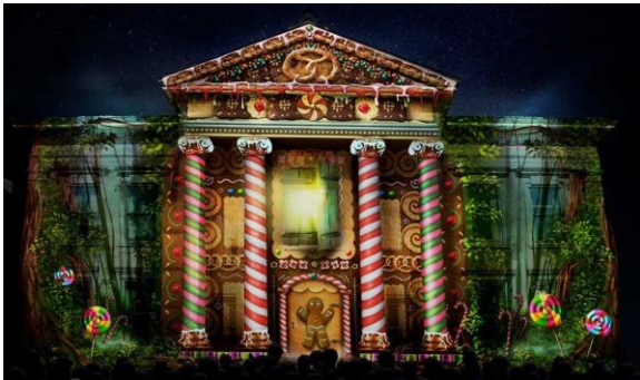
Figure 18, a colossal candy-laden gingerbread house. the Carnegie Library, New York 2017