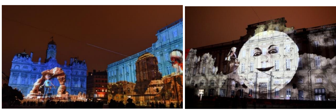
Figure 10, Show (Once upon a time) from the Festival of Lights 2017 in Lyon