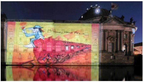
Figure 21, "Hey Honey" painting by The well-known musician Udo Lindenberg displayed on the facade of the famous Bode-Museum Pictures by prominent artists transformed the museum into a special canvas.