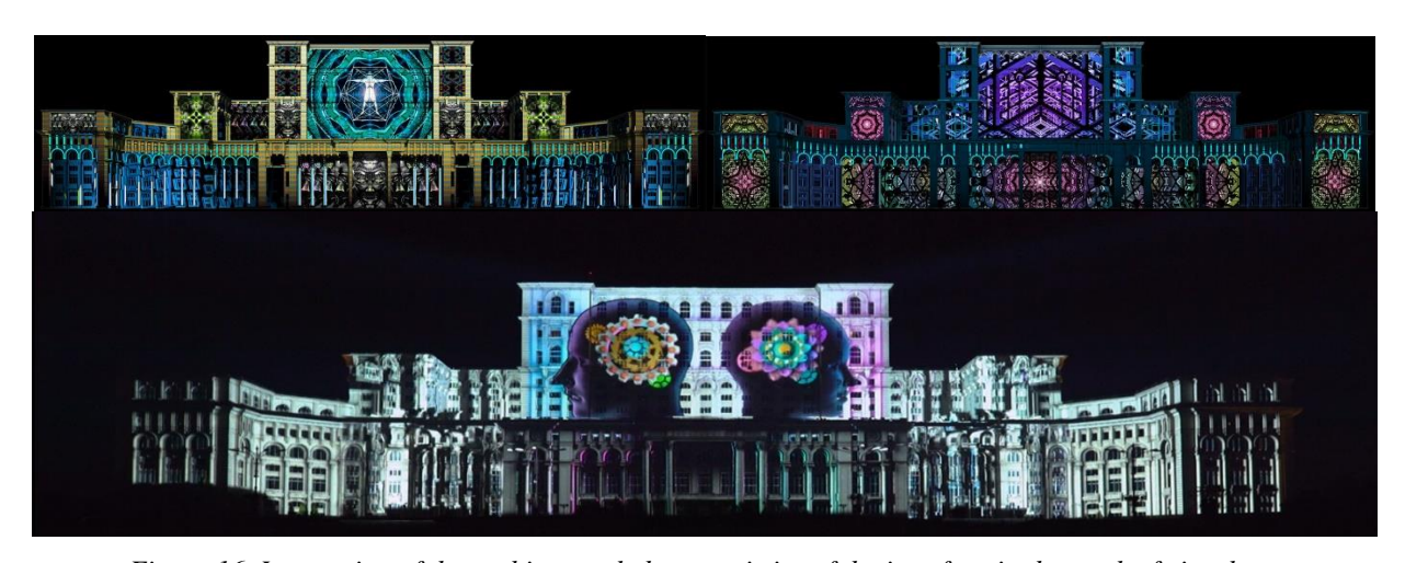
Figure 16, Integration of the architectural characteristics of the interface in the work of visual art. Director: Antonin Križanić, Visual Design: Antonin Križanić, Dávid Vígh

The show expresses the amalgamation of the architectural element with art, animation, and different life fields such as physics, engineering, chemistry, space, etc. (Figure 16) (Harris, Miriam 2016).