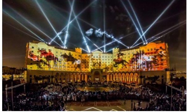
Figure 23, showing the front facade of the Ritz-Carlton Hotel in Riyadh and a 3D projection projection on it, 2014