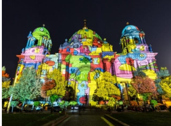
Figure 19, Berlin Cathedral in the Festival of Lights 2019 the show featuring pictures by other international artists

Also, the facade of the Neuer Marstall (a listed historic building in Berlin, Germany. The building erected in 1901 in the neo-baroque style) was represented at the Festival of Lights as a projection location for the House of Nature. The projection focused on the beauty of our planet. Nature and culture merged together. A unique view of the earth was created from outer space. Fascinating animal shots alternated with landscape shots. At the end of the projection, the facade of the New Marstall was transformed into a beautiful mapping that merged the diversity of nature with Berlin's urban landscape. The preservation of unspoilt nature and the associated themes, such as climate protection, have for many years had a firm place in the Festival of Lights. The special light art project draws attention to topics such as climate and species protection, environmental pollution or sustainability and encourages viewers to reflect and rethink. (Figure 20). The Bode-Museum was also used in the Festival of Lights as a projection location for paintings by international artists. (Figure 21.22)