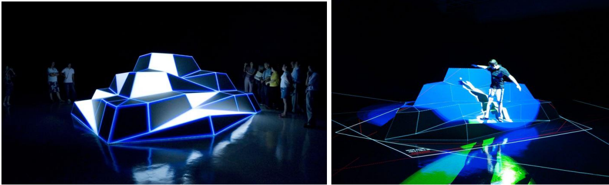
Figure 1, showing a large interactive entertainment model. Space of about 40 people To wander around and sit on it and explore its many facets.

projection mapping. An additional sensory system detects people's positions and proximity. (Figure 1).