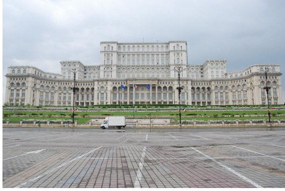
Figure 15, showing the 3d video mapping on the architectural facade of the Parliament Palace