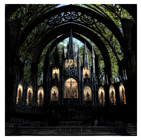
Figure 12, It shows the walls of Notre Dame Cathedral as they turn into glass surfaces through which leaves, birds and nature appear to merge with the religious character of the church

To create the various effects, 21 projectors were used, along with 140 lamp and four devices dropping laser and 20 mirrors. Complementing the visuals is an orchestral soundtrack, which was written by Troublemakers' Gabriel Thibaudeau and Marc Bell. The music in the soundtrack records a performance by thirty musicians, twenty instrumentalists and the Casavant frères basilica tube organ, which is over 120 years old.