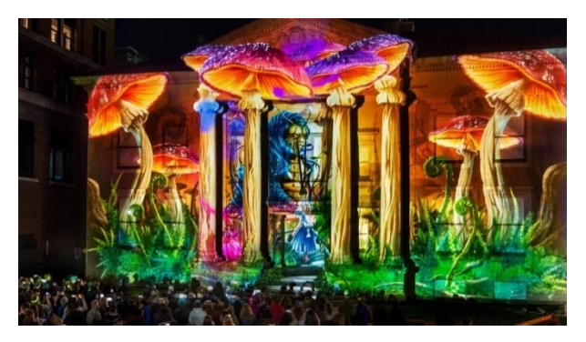
Figure 17, Alice in Wonderland displayed on the Carnegie Library 2017

The festival takes place every year at the beginning of September and continues for three days and attracts more than 35,000 people every year. Also 30 3-Chip DLP laser projectors are used in place to operate the LUMA.