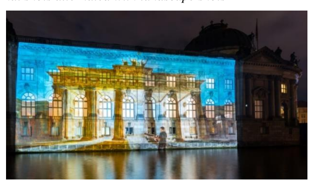
Figure 22, The painting "One Morning in Berlin" in the "House of Art" at the Bodemuseum by the artist Otto Waalkes