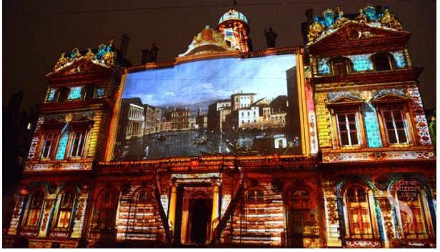
Figure 8, Masterpieces of the facade of the Museum of Fine Arts are displayed on the facade of the building Place des Terreaux 2014

The graphics and illuminations appeared beautifully for 3D mapping on the façades of the buildings of Place Antonin Poncet, Lyon, where a cosmic journey of "Laniakea" (a giant galaxy group identified by a group of astronomers, including Helene Courtois of the University of Lyon) formed by thousands of luminous globes was shown, clusters of luminous points, of stars, which like a galaxy, form constellations, then fall apart. (Figure 9) (Shin. Nara.2014).