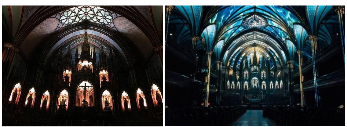
Figure 11, The light and sound installation is aimed to enhance the historic beauty of the church's interior.

The show begins with a tour by the attendees inside the cathedral and discovering the beautifully lit artworks, then the light projections begin on the perimeter of the church from the inside surrounding the viewers from every direction. The orchestral notes then combine with the architecture of the building to create a 3D projection Mapping performance that captures the imagination of the spectators, for this reason AURA light colors enhance the detailing of the basilica for an interactive visual show. Stained-glass windows in Notre Dame express events from the religious history of Montreal, so in effect, it also highlights the history of the city. (Figure 11)